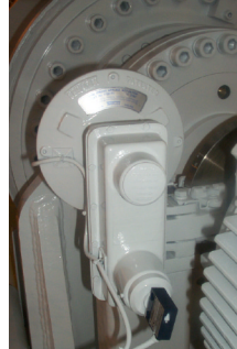
Electric Disc Brake