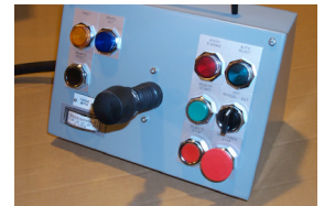
Remote Operator Assembly