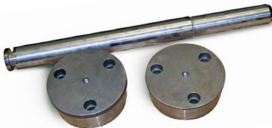
Shafts & Pins